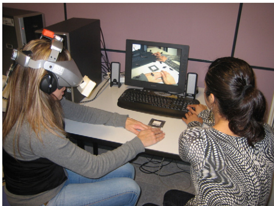
Use of the system during exposure therapy.

Participants could see the actual world through the HMD; everything that they saw was real except the feared stimuli (in this case, cockroaches). The application used markers consisting of white squares with black borders that contained symbols or letters.