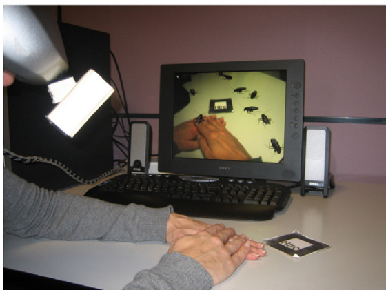
A participant interacting with the cockroaches with her hands